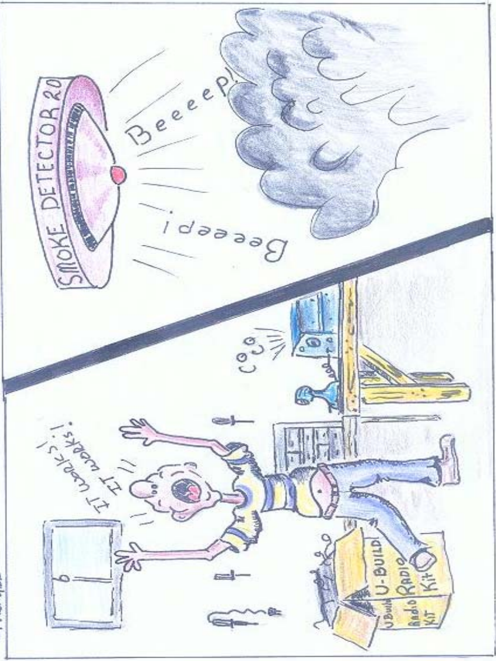
The Thrill Of Victory ..... AND ..... The Agony Of Defeat.