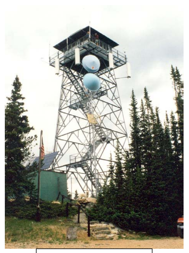
OVERALL VIEW OF DEADMAN HILL RADIO AND MICROWAVE SITE